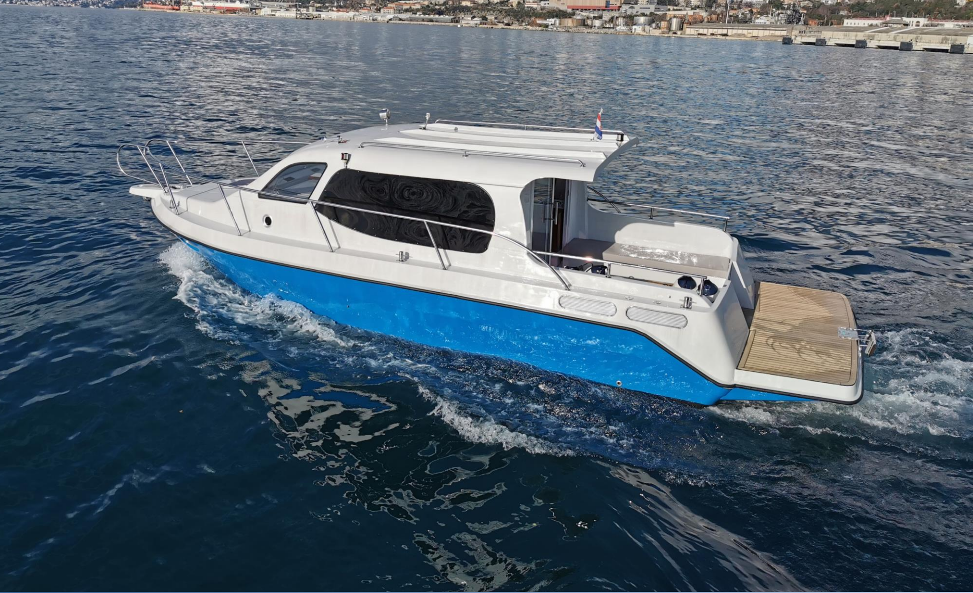
AC DC daycruiser 12.0